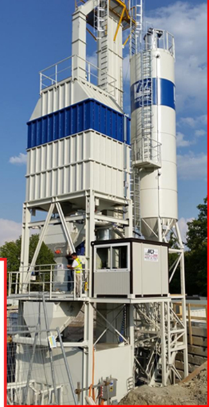
Vertical Concrete Plants