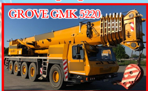
GROVE GMK 5220