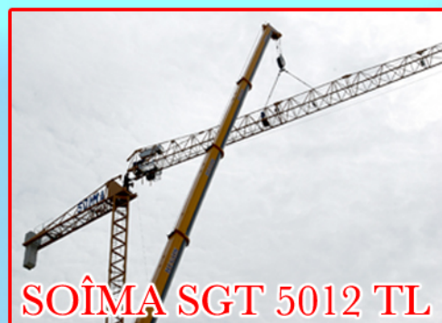
SOÏMA SGT 5012 TL