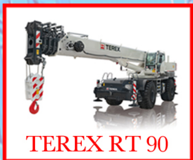
TEREX RT 90