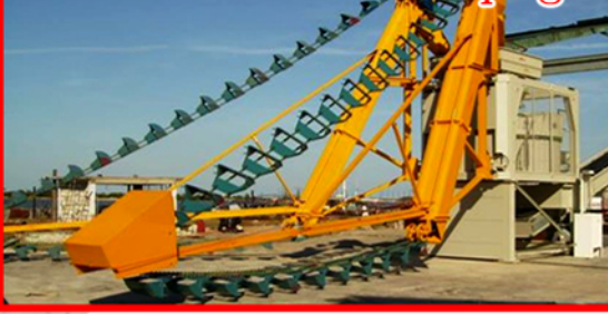
Concrete Plants with Scraping Unit