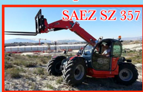
SAEZ SZ 357