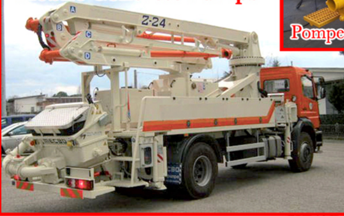
Mobile Concrete Pumps