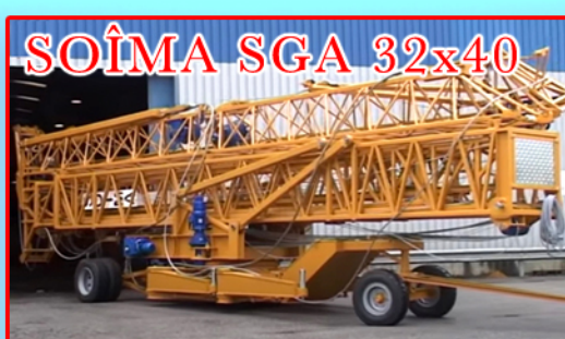
SOÏMA SGA 32x40