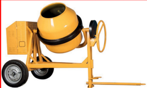
Concrete Mixers for the Tropics