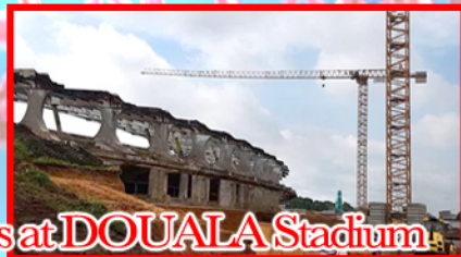
Assembly and Erection of SOÏMA Tower Cranes at DOUALA Stadium

LOC & MAT has been an official distributor of SOÏMA cranes for more than 20 years.